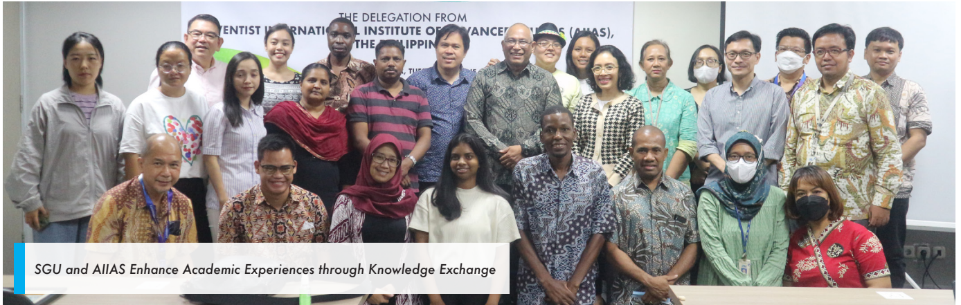
SGU and IIAS Enhance Academic Experiences through Knowledge Exchange