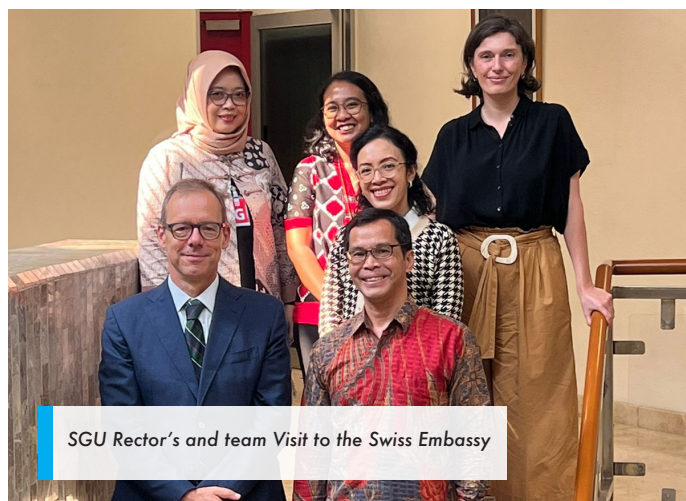
SGU Rector's and team Visit to the Swiss Embassy