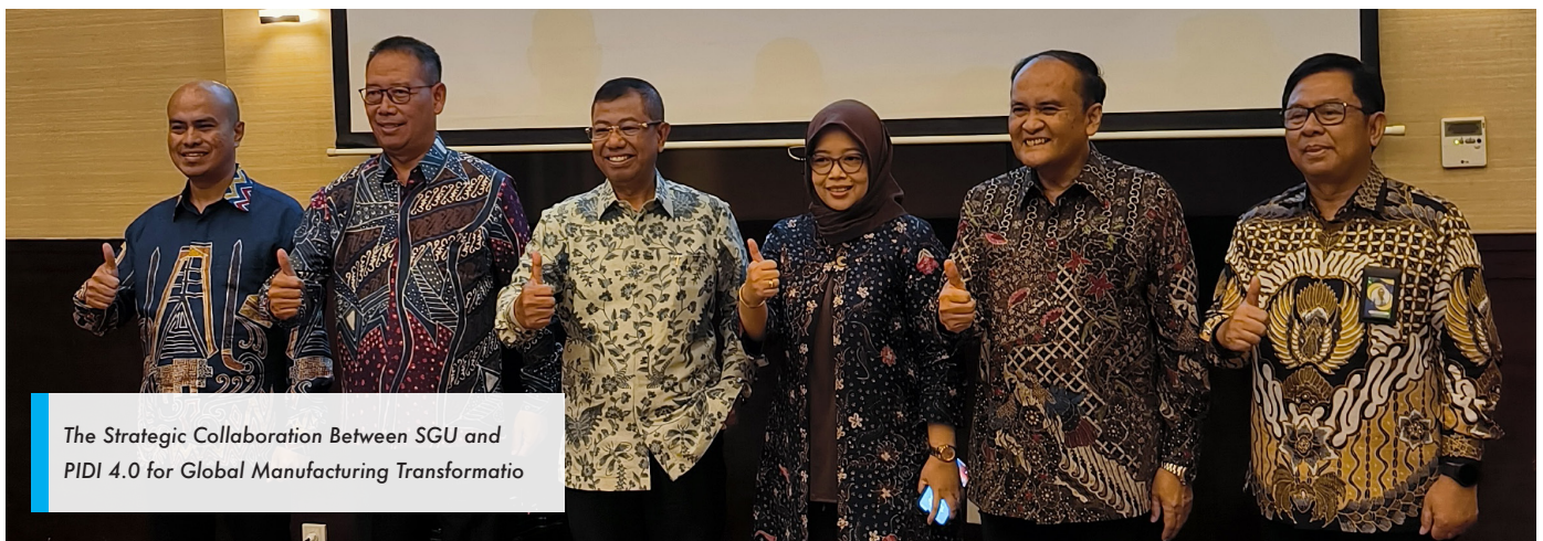
The Strategic Collaboration Between SGU and PIDI 4.0 for Global Manufacturing Transformatio