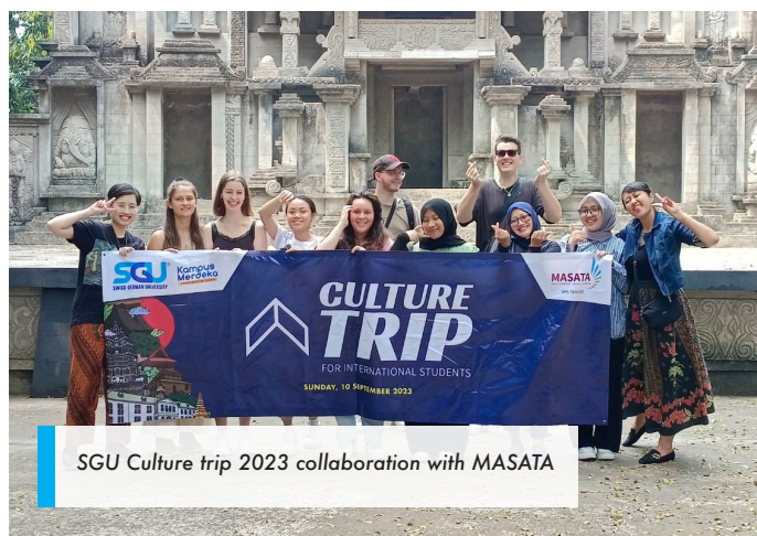
SGU Culture trip 2023 collaboration with MASATA