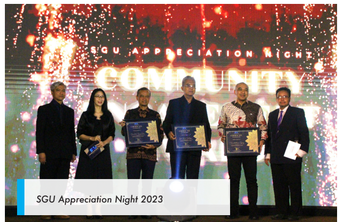
SGU Appreciation Night 2023