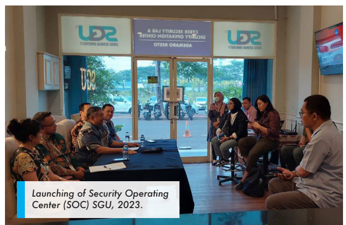
Launching of Security Operating Center (SOC) SGU, 2023.