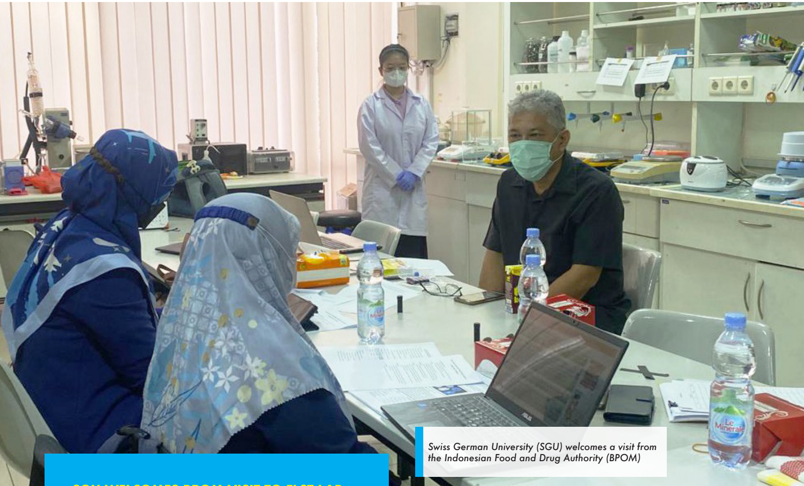
Swiss German University (SGU) welcomes a visit from the Indonesian Food and Drug Authority (BPOM)