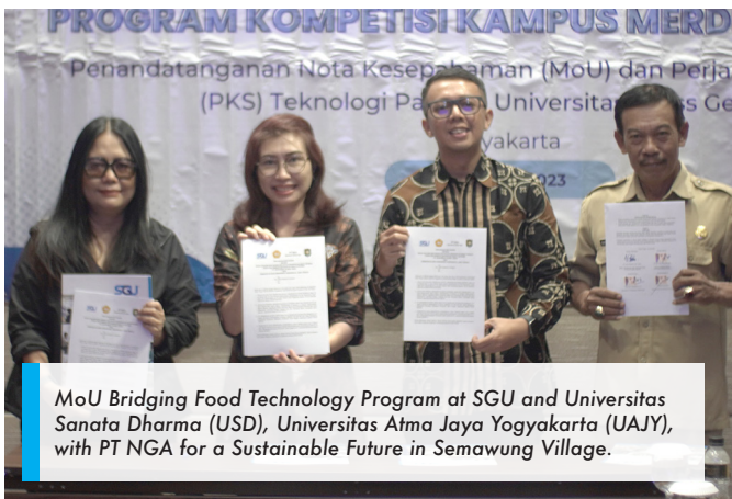
MoU Bridging Food Technology Program at SGU and Universitas Sanata Dharma (USD), Universitas Atma Jaya Yogyakarta (UAJY), with PT NGA for a Sustainable Future in Semawung Village.