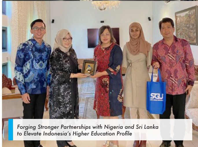
Forging Stronger Partnerships with Nigeria and Sri Lanka to Elevate Indonesia's Higher Education Profile