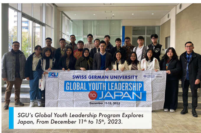
SGU's Global Youth Leadership Program Explores Japan, From December 11 th to 15 th , 2023.