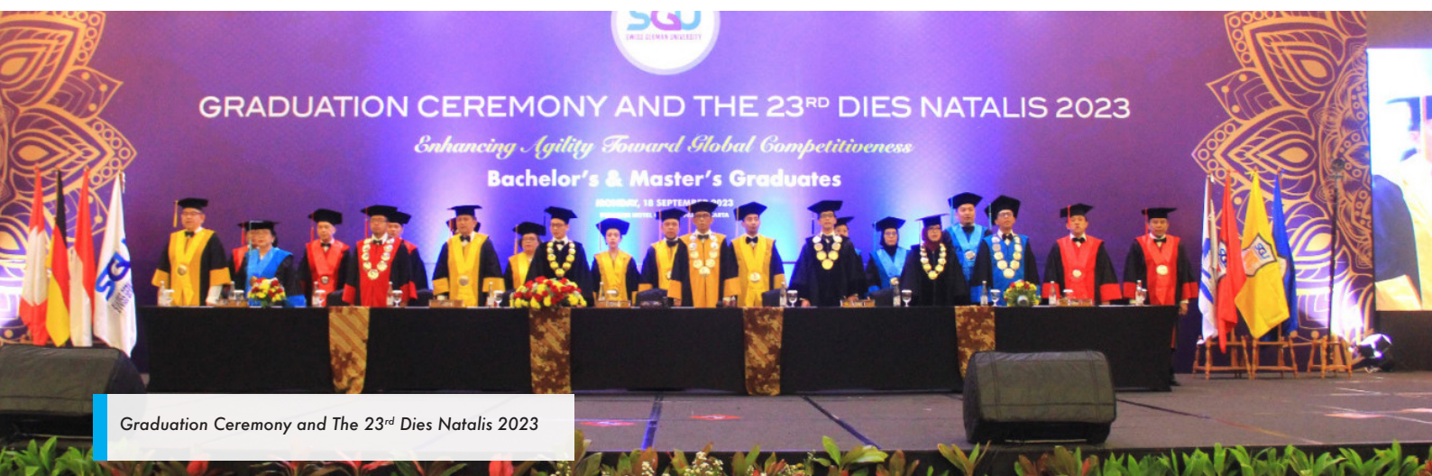
Graduation Ceremony and The 23 rd Dies Natalis 2023