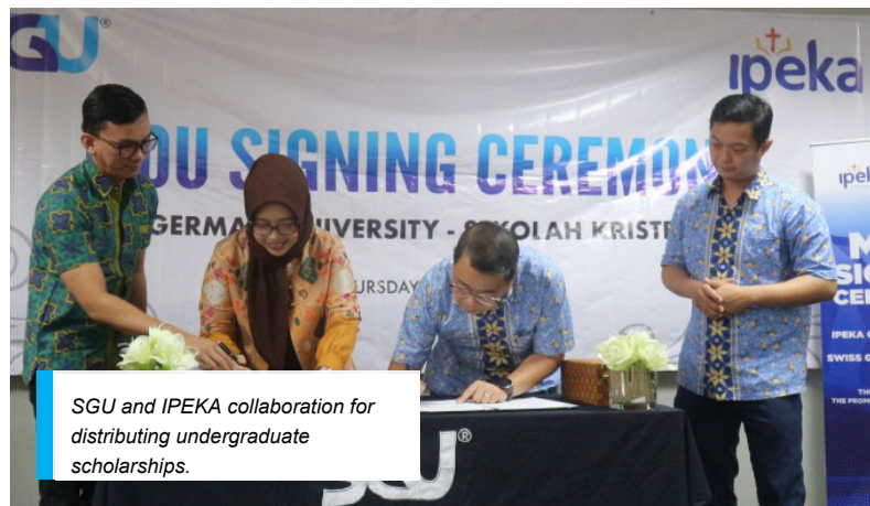
SGU and IPEKA collaboration for distributing undergraduate scholarships.

This is in line with the theme of National Education Day 2023, namely "Bergerak Bersama Semarakkan Merdeka Belajar." This theme aligns with SGU's vision, which encourages students to learn theory in the classroom and to travel the world seeking knowledge and experience outside campus in the presence of independent campus programs.